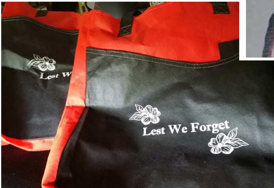
Left: Convention goody bags